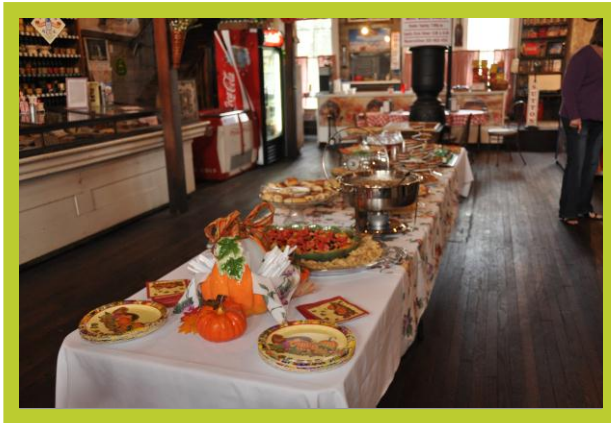
Thanks to the Sutton Store and their terrific group of workers who made the day so special!