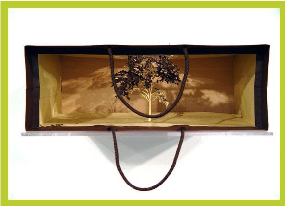
Louis Vuitton Shopping Bag Forrest Series By yuken teruya